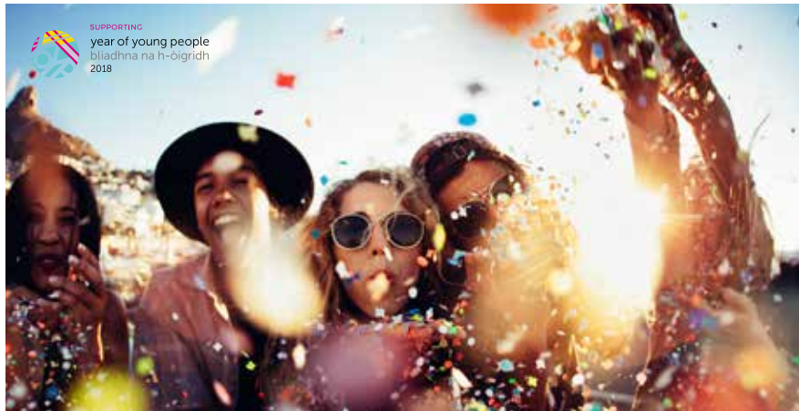
Don't use the colour logo on a photographic background.