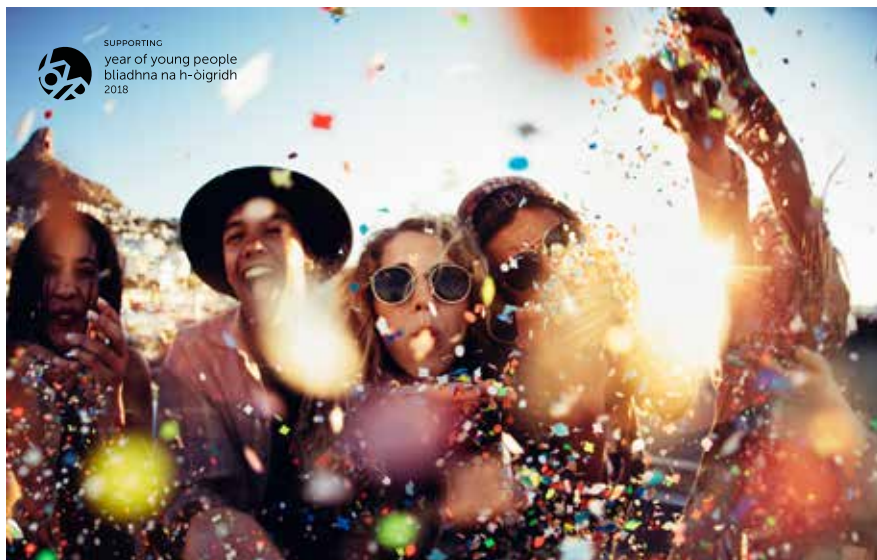
Our mono logo on a light background.

Please make sure that the logos can clearly be seen against the photography (you'll find more information on this subject in the 'a few things not to do' section).