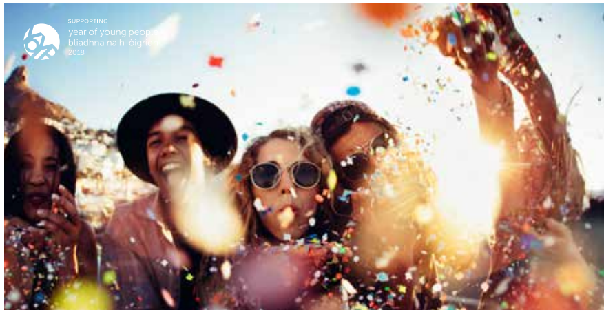
Don't use the reversed logo on bright or light coloured backgrounds.