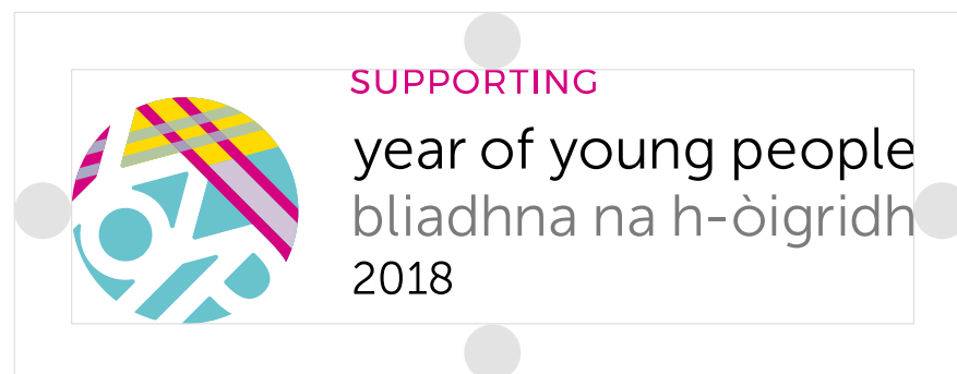
The exclusion area around the logo.