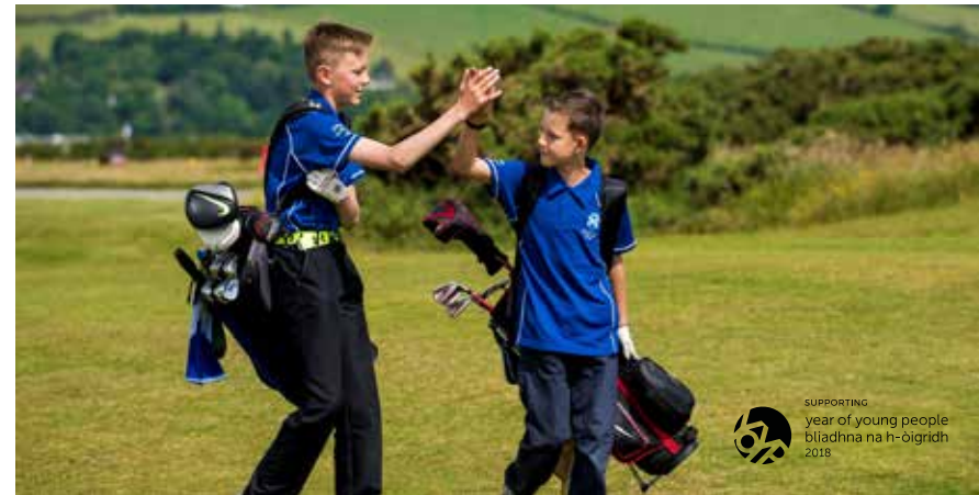
Don't use the black logo on dark backgrounds.