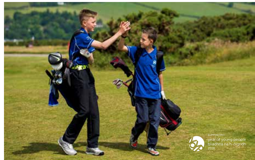
Our reversed logo on a dark background.