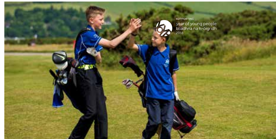
Don't let the logo float within images – always align to either the top left or lower right corners.